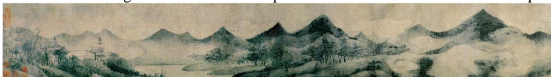
Figure 4: Xiaoxiang wonders map Song dynasty Mi Youren

and standards of composition in Chinese painting. In the concept of composition of traditional Chinese painting, Chinese painters pursue the spatial layout of the picture. Lao zi's theory of "knowing the white color, keeping the black color, and being the style of the world" has exerted a significant and far-reaching influence on the composition method of traditional Chinese painting.