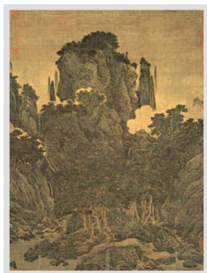
Figure 1:Wan-Valley Pine Wind Map Northern Song Dynasty Li Tang

Chinese painting pursues the artistic spirit and artistic conception of the painting. Through the painting, it expresses the artist's ideological connotation and spiritual realm. Chinese painting works embody the artist's brilliance and humanistic ideals. The highest realm of Chinese painting is the artist's passion based on strong cultural accomplishments. The cultural connotation and character of the personality are used to pursue the "vividness and vigor" of the picture. This kind of charm and impetus showed in Chinese artist's painting creation, which is the characteristic of "fire" in the five elements.