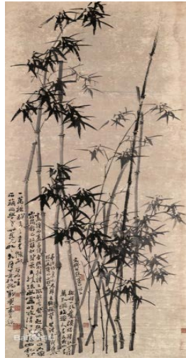
Figure3:Ink bamboo Qing dynasty Banqiao

predecessors are very rich in the diversity of expression techniques that embody drawing creation. The Tang dynasty painter Zhang Yan proposed that "foreign teachers can make things happen in the heart," which means that Chinese painting's creative technique is to seek artistic truth by comprehending the experience from nature. Gu Kaizhi, a famous painter in the Eastern Jin Dynasty, put forward "to write God in form" to warn Chinese painters that the creative technique of painting is to express the inner essence and spirit of things by depicting the external image of objects. Also, shi tao, a famous painter in the Qing dynasty, proposed that "I am what I am and I am what I am", etc., which are all manifestations of the expressive techniques of Chinese painting creation. The expression techniques of painting creation can best reflect the artist's quality and personality.